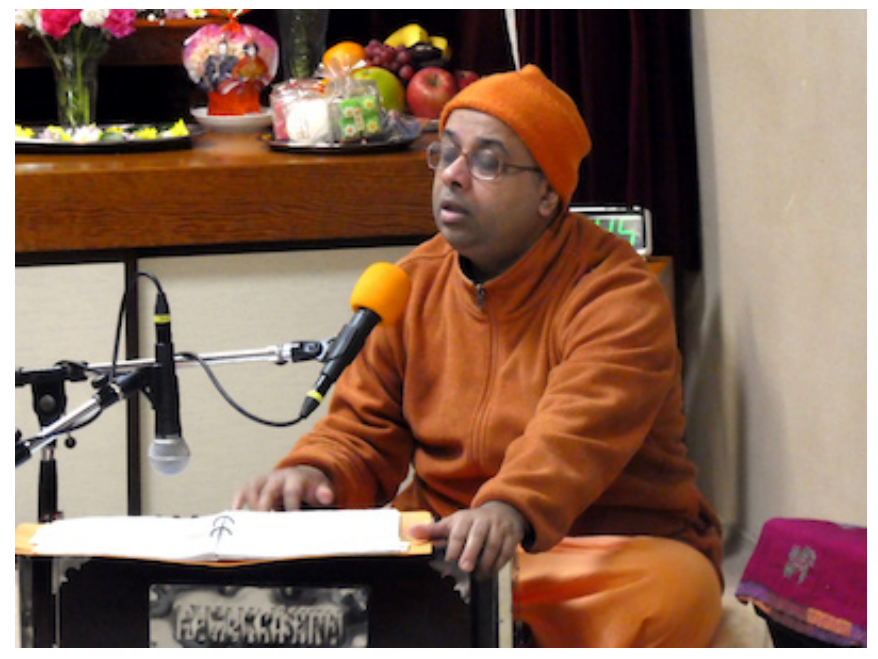
February 2022 / Volume 20 Number 02