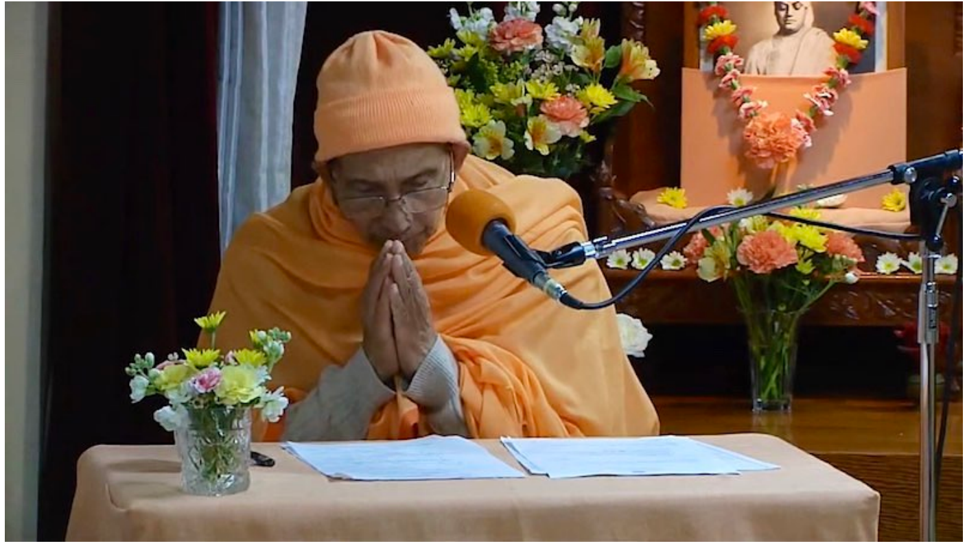
The Vedanta Kyokai Newsletter

Some time later, one of the girls in attendance wrote of her reminiscence of that day, saying that as a Christian she recognised that all the clerics' arguments had been defeated by Swamiji. She, however, remembered feeling happy as the hour passed during the experience. It was a period of free thinking and the atmosphere of the auditorium had an impact on everyone, many recognising that Truth is not sectarian, but that Truth is universal.